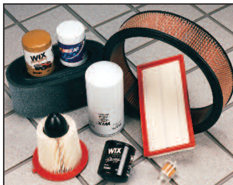
A sample of the stamped parts and products manufactured by the Wix Filtration Products Division.