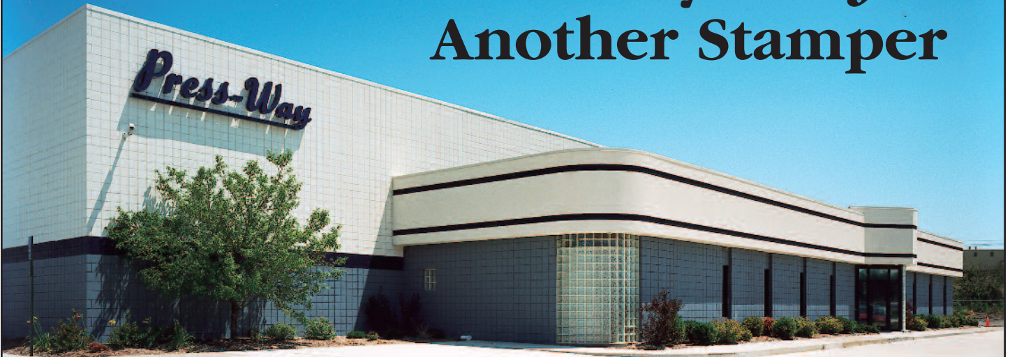
Press-Way's new 100,000 sq. ft. facility which recently went into operation in Clinton Township, Michigan.

H oused in an attractive brand new 100,000 square foot facility, Press-Way, Inc. doesn't really fit the stereotype of the average Detroit-area auto parts stamper.