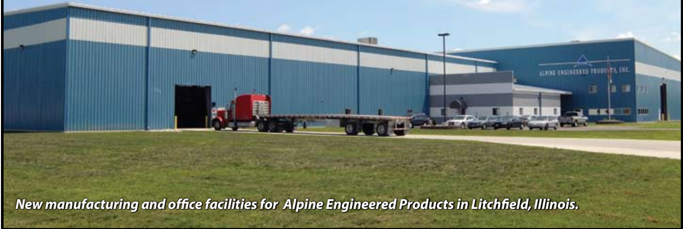
New manufacturing and office facilities for Alpine Engineered Products in Litchfield, Illinois.

A division of Illinois Tool Works (ITW) Building Components Group, Alpine Engineered Products is a leading worldwide supplier of technology-driven products for the building component industry.