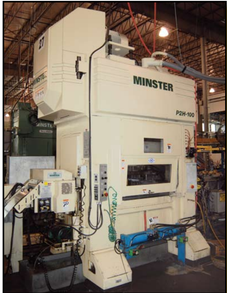
Minster P2H presses have helped increase production at Alpine.

"We manufacture more than 250 sizes of truss plates in different gauges and strengths of steel," Plant Manager