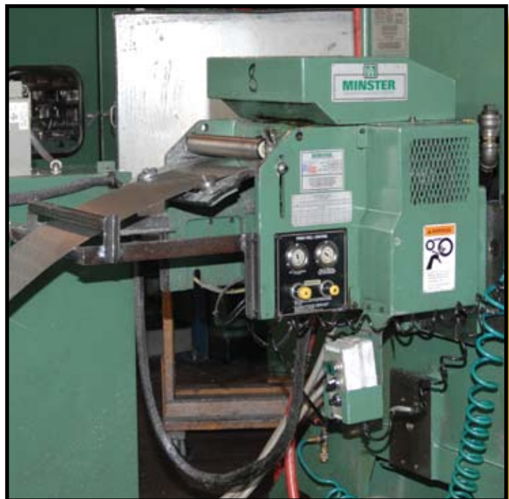
Minster MEF2-CS bracket feeds help integrate production.

“All of our straightside presses are Minsters and I wouldn’t have it any other way,” Wirth added. “I’ve worked with different presses and I’ve been around different presses. With Minster the reliability is there -- no doubt about it. The engineering that goes into the Minster presses makes a big difference.”